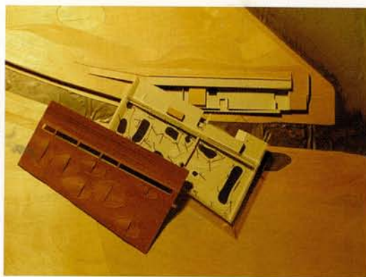
作 者 / Author: Filippo Taidelli 作品主题 / Theme: Infrastructure and Landscape / 城市基础设施和景观

学 校 / School: Politecnico di Milano Faculty of Architecture, Italy 意大利 米兰工学院 指导教师 / Faculty Adviser: Remo Dorigati 作品主题 / Theme: Consideration on Urbanism / 关于都市主义的思考