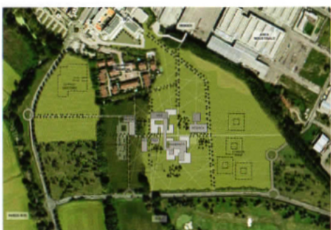
Masterplan of the research campus at the Istituto Clinico Humanitas