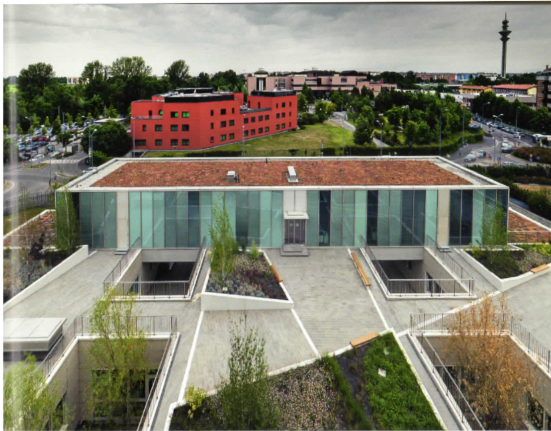
View of the office building overlooking the garden