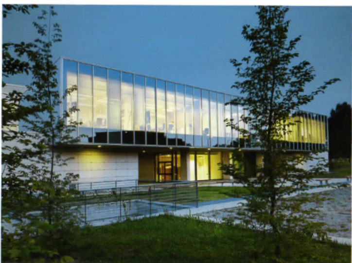
Nocturnal view of the Humanitas Holding Office building

The connection with the convalescent wing opposite is created by a new roof system that is covered with a roof garden and large planters that can be enjoyed by visitors and can be overlooked by convalescing patients from their windows. Within a wider urban planning project for greater Milan, FTA is studying a project for the construction of a research campus for the Istituto Clinico Humanitas, again in Rozzano. The university structure, integrated within a larger infrastructural project, will provide services and space for a thousand students. V.M.